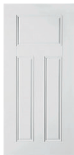
Craftsman 3 Panel