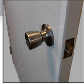
The 1800-Series features a capped edge panel for enhanced durability.