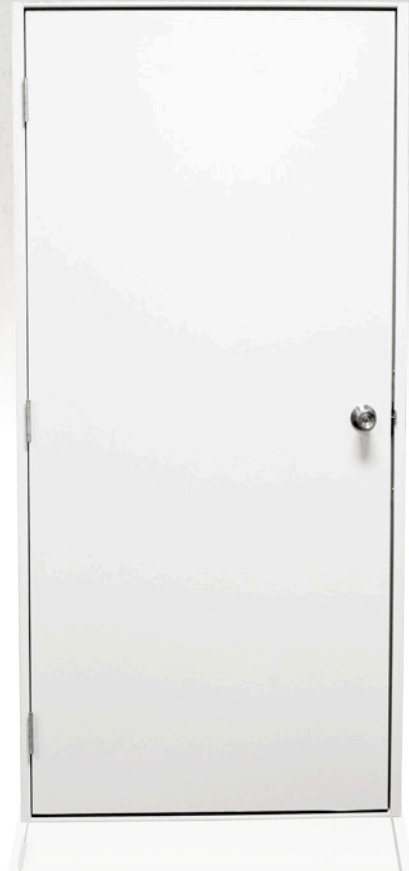
1700-Series (1734 and 1795)