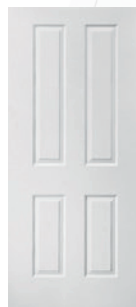
True 4 Panel