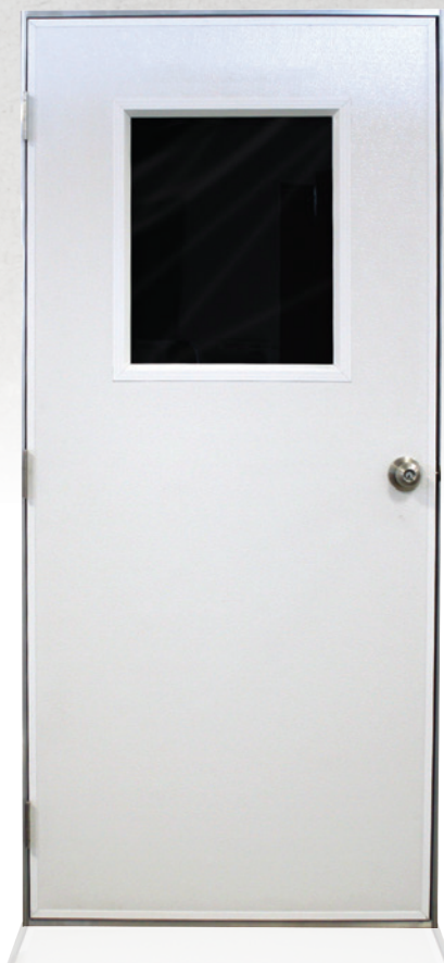
1800-Series (1852, 1853, 1872 and 1873)