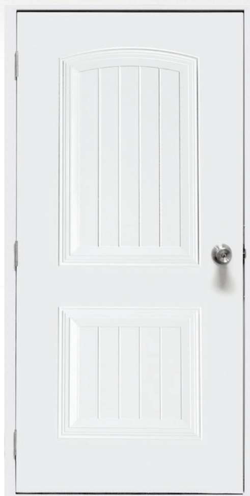
1900-Series with 2 Panel Arch Top Plank embossment (1920 and 1934 models)