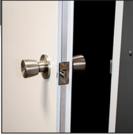
The rolled edge on the 1700-Series gives the door a commercial and finished look.